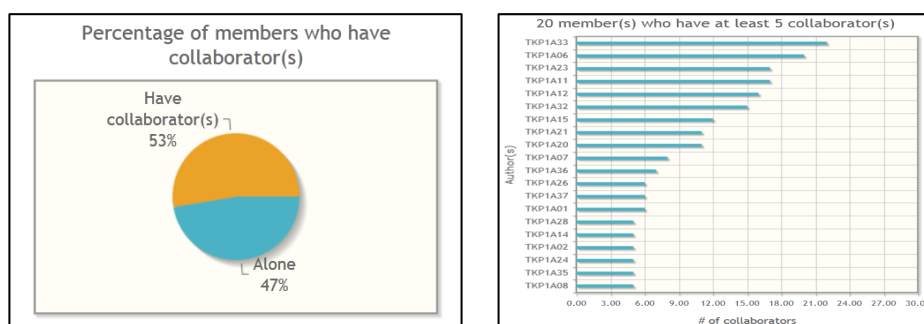
Figure 1. Sample view of “Are we collaborating” analysis results.

Figure 1 presents sample results from a class of 38 secondary school students. The pie chart shows that 53% of students had at least five fellow students build on at least one of their notes. The bar graph on the right shows the exact number of students who built onto the notes of each of these students (e.g., six students built onto the notes of TKP 1A01, and 22 onto the notes of TKP1A33).